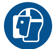
EYE & FACE PROTECTION