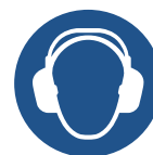
HEARING PROTECTION (Where noise exceeds 85dB)