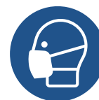
MASK (In Dusty conditions)

SUN PROTECTION: Protective clothing and sunscreen may be required for extensive outdoor use.